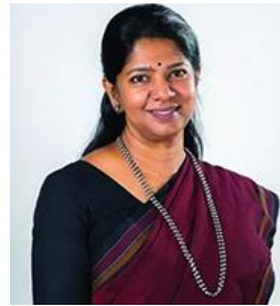
Hon. Kanimozhi Karunanidhi Member of India Parliament