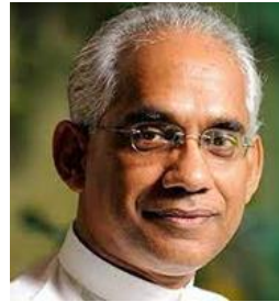
Eran Wickramaratne Member of Sri Lanka Parliament, Former State Minister Of Finance