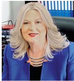
Dr. Edita Tahiri Leader of the independence of Kosovo. Former Deputy Prime Minister and Minister of Foreign Affairs of Kosovo